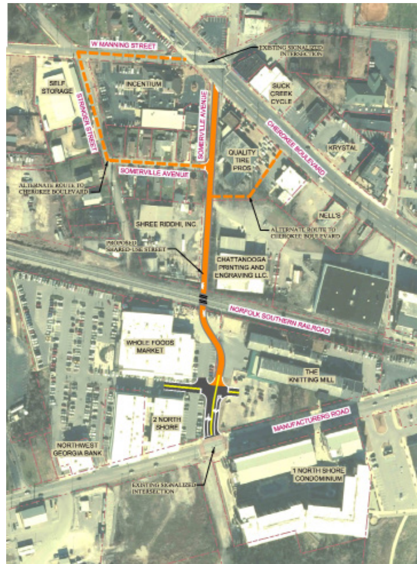
As this concept shows, a connection is feasible since an existing road network is in place north of the railroad; however, there are physical barriers such as fencing, rail crossings and loading areas that must be considered in any future enhancement efforts. Connecting North Shore neighborhoods (Hill City, Stringer's Ridge and North Chattanooga) with a more direct route from Cherokee Blvd. to Manufacturer's Rd is needed.